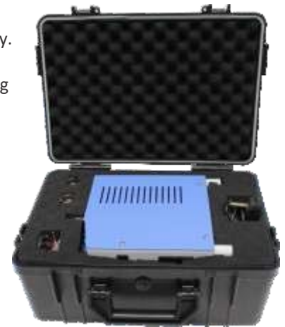
Carrying Case (optional)