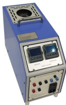
Instrument with Indicator